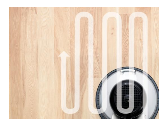
Move the machine in a systematic pattern