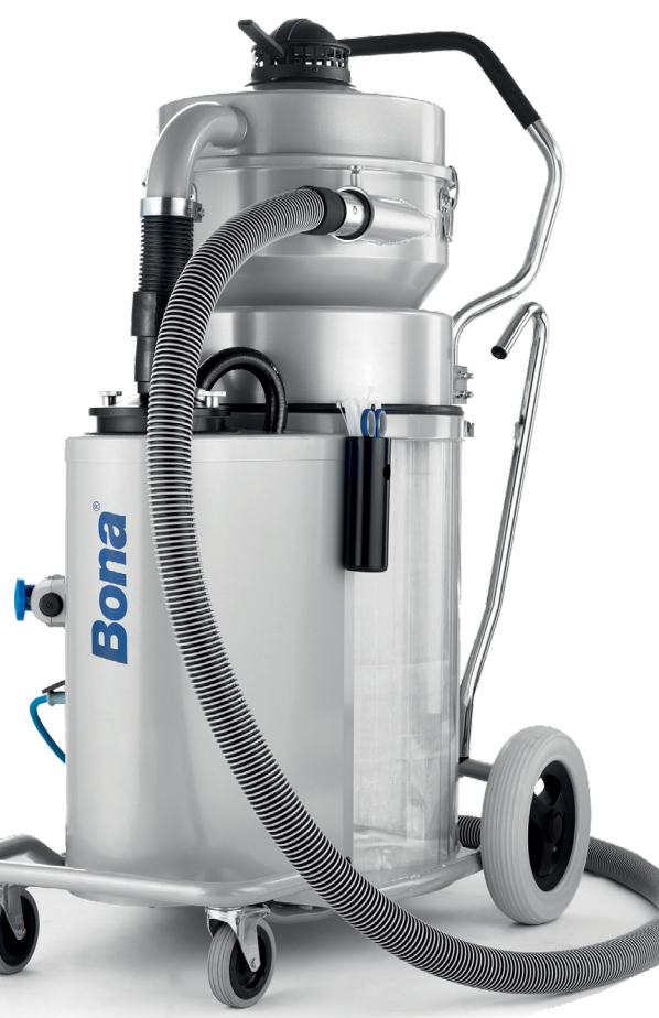
Bona DCS 70