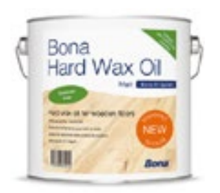
Available in 2.5 Ltr can