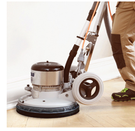
Reduces time spent crouching or kneeling, allowing for an ergonomic working process