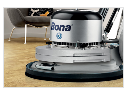
Optional 7kg attachable weights