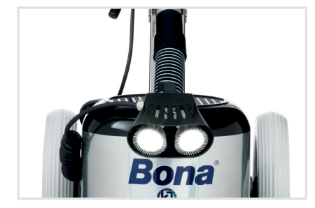
Powerful LED headlamp option