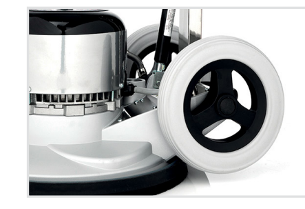
Large wheels for easy manoeuvrability