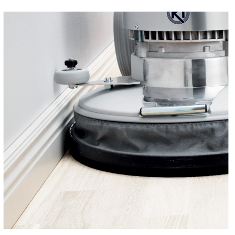
Wall distance wheel maintains correct distance & prevents damage to skirting boards or walls