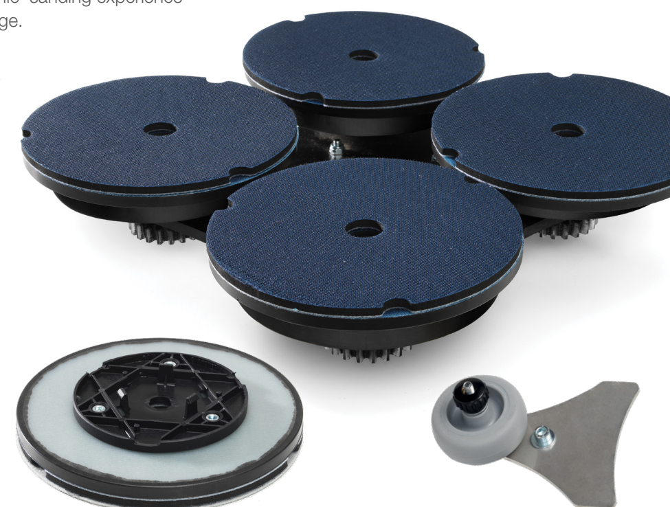
Pads are securely fastened with click-on Connect System