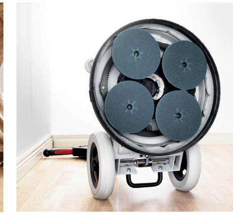
Wider 178 mm discs reach all the way to the edge of the skirt